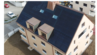
Apartment building / public buildings