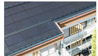
Snow guard option