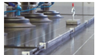
Photovoltaic load test modules