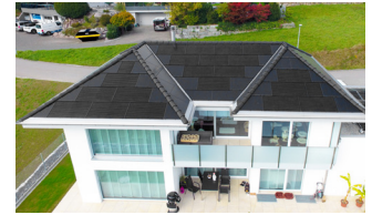
one family house